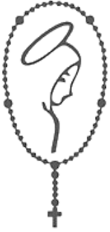
PARISH OF HOLY ROSARY